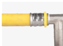
MULTI-LAYER COMPOSITE PIPE