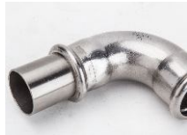
STAINLESS STEEL PIPE