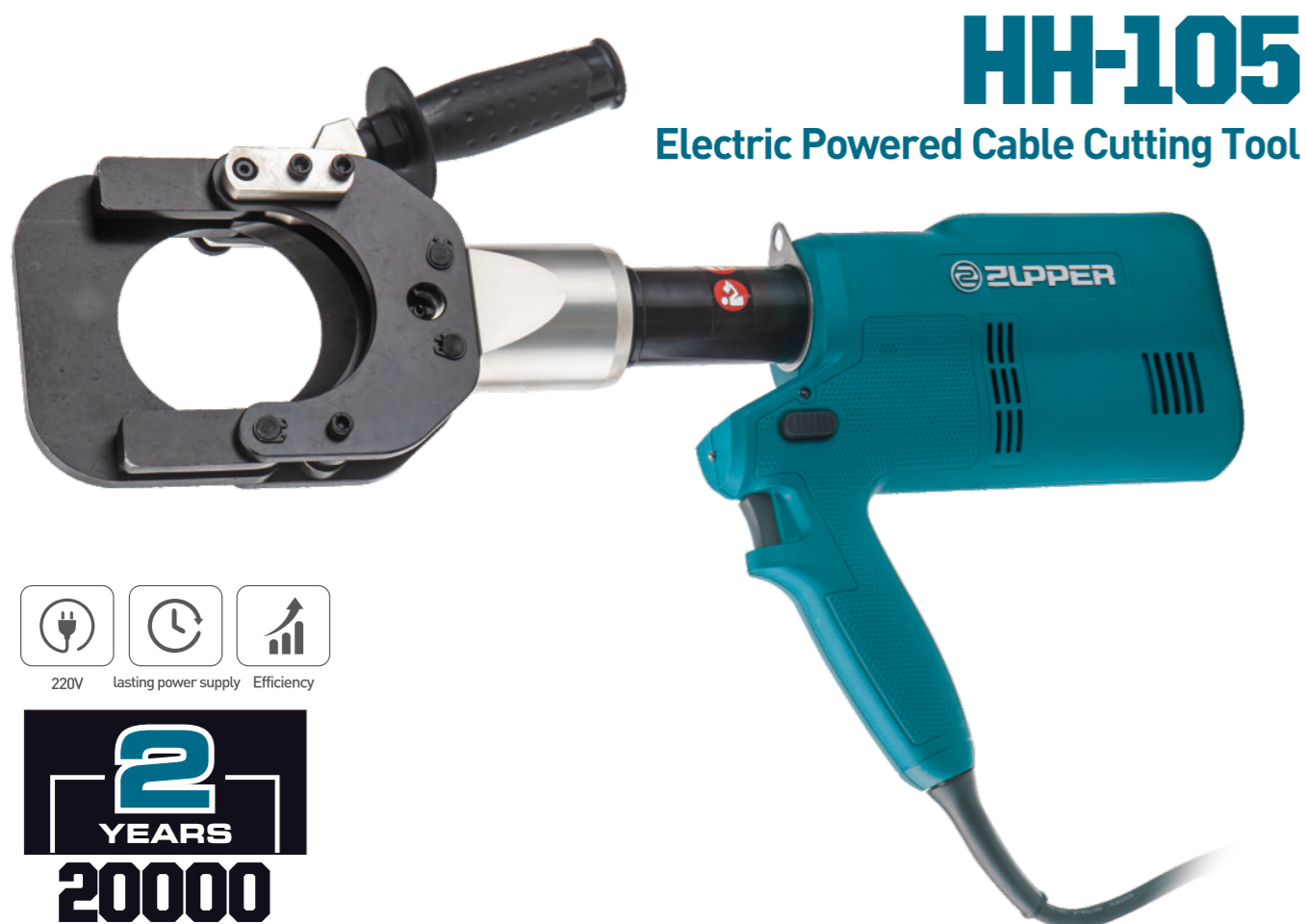
HH-105 Electric Powered Cable Cutting Tool

520W HIGH POWER 220V lasting power supply, Reliable and Stable